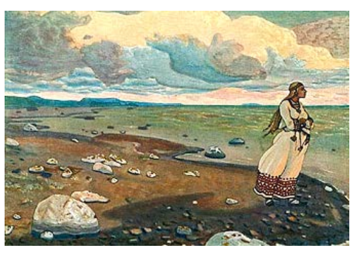
(Artist: Nicholas Roerich Date: 1942)

The nectar of your ancient ocean my soul has drunk! O goddess of peace!