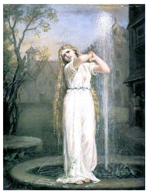
(Artist: John William Waterhouse Date: 1900)

The flow of your divine nectar will pervade my subtle being.